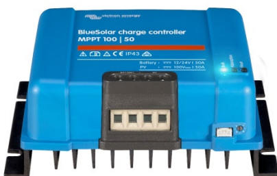
BlueSolar Charge Controller MPPT 100/50