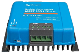
Solar Charge Controller MPPT 150/70-Tr