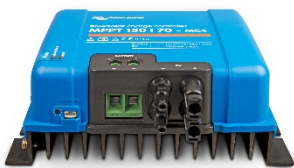
Solar Charge Controller MPPT 150/70-MC4