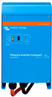
Phoenix Inverter Compact 24/1600

The possibilities of paralleled high power inverters are truly amazing. For ideas, examples and battery capacity calculations please refer to our book 'Energy Unlimited' (available free of charge from Victron Energy and downloadable from www.victronenergy.com ).