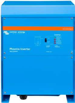
Phoenix Inverter 24/5000