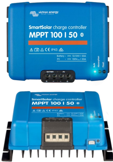
SmartSolar Charge Controller MPPT 100/50