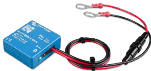
Smart Battery Sense