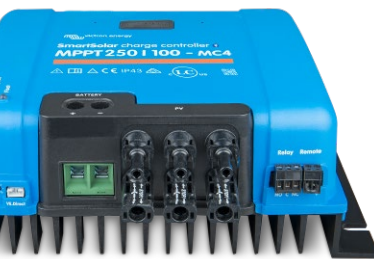
SmartSolar Charge Controller MPPT 150/100-MC4 without display