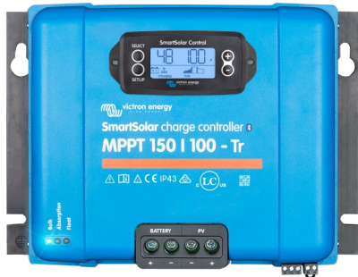
SmartSolar Charge Controller MPPT 150/100-Tr with optional pluggable display