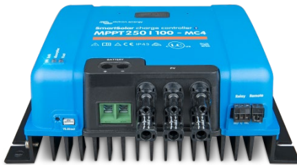
SmartSolar Charge Controller MPPT 250/100-MC4 without display