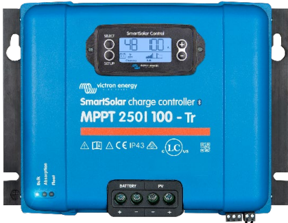
SmartSolar Charge Controller MPPT 250/100-Tr with optional pluggable display