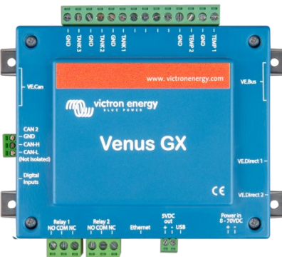
Venus GX with connectors