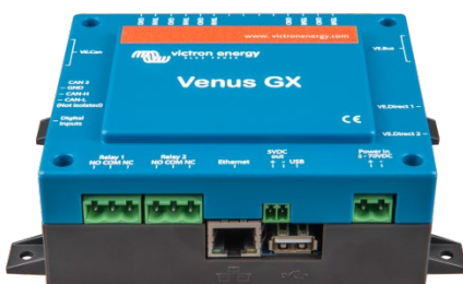
Venus GX front angle