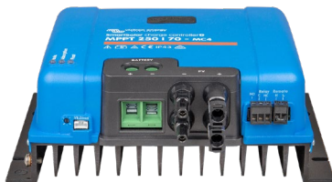
SmartSolar Charge Controller MPPT 250/70-MC4 without display