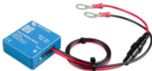
Bluetooth sensing: Smart Battery Sense