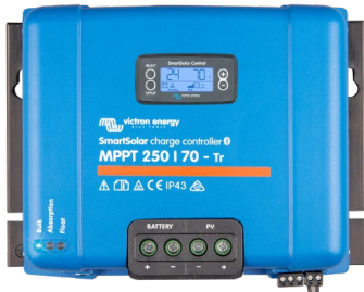
SmartSolar Charge Controller MPPT 250/70-Tr with optional pluggable display