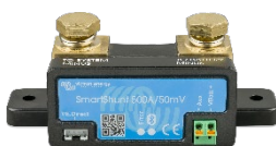
Bluetooth sensing: SmartShunt